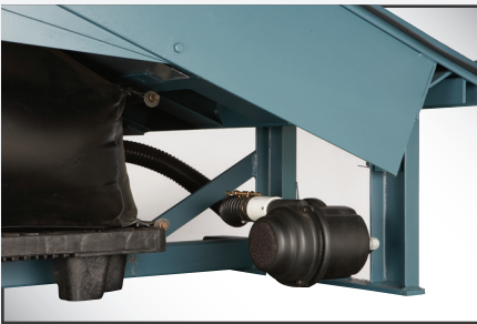
Low pressure 115V/1PH fan motor provides a high volume air supply to reliably activate and position leveler.