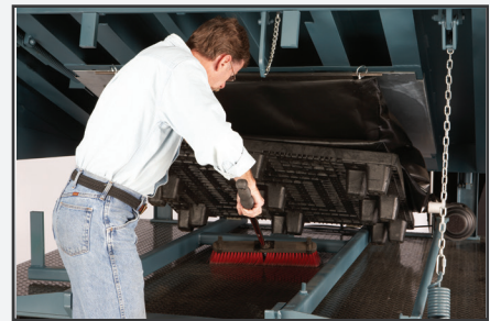
Easy clean leveler frame permits effortless clean out of pit floor.