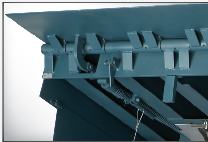
Dependable lip extension via unique lip latch mechanism is fully yeildable if impacted by backing trailer.